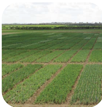
Right: Limagrain Vining Pea Trials

date, soil type, sowing rates and seed treatments. We will be trialling our portfolio against other varieties in the market place. We will also continue to trial all of our varieties across Europe and further afield.