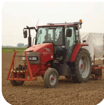
New GPS allows precision drilling to accuracy of just 1cm

tion, giving us the freedom to drill anywhere in the country. The main advantage we gain from this system is that each trial plot is exactly the same size; this is essential when analysing results and making selections.